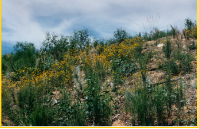
2000 – Revegetation on bund wall. Over 80 species are now well established on the site.