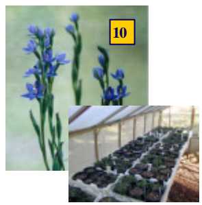
July 2001 – Orchids were collected from the site and used to build up numbers for planting on site.