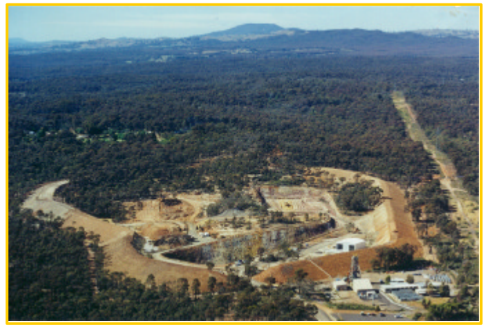
1999 – Development and progress. To minimise the impact on local residents an earth bund was constructed to attenuate noise.